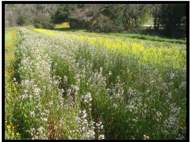
Bee Pasture, Oak Hill Farm, Glenn Ellen, CA

There is a small annual, tax deductible fee of $25 to participate. Importantly, 100% of that fee serves a high utility purpose—augmenting cost-share assistance provided to farmers and ranchers through USDA and other programs. The Farm Bill provides cost-share assistance and incentives through programs managed by the USDA Natural Resources Conservation Service (NRCS) to help willing farmers and ranchers increase pollinator habitat and forage. Seldom do these programs cover all the costs of installation and management of plantings and practices.