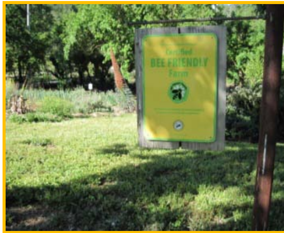
Metal Sign Posted on BFF™-Certified Farm